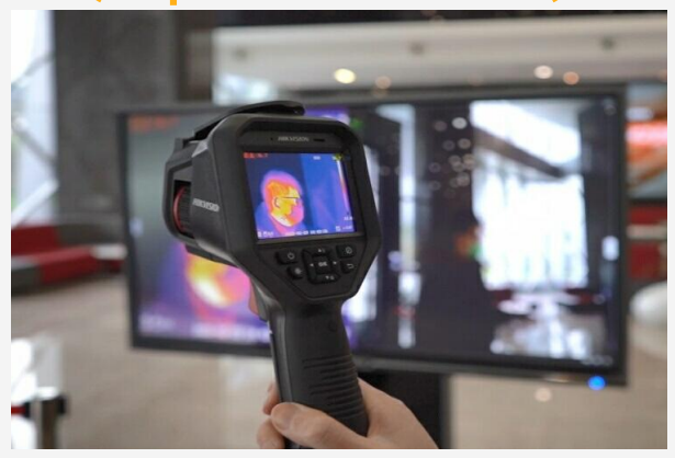
Multiple Camera Solution (Tripod or Fixed)